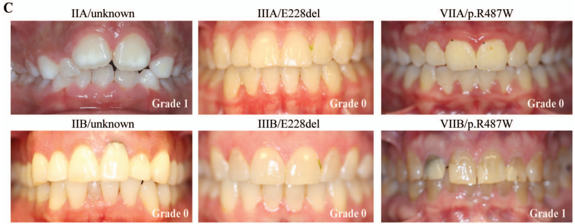
Supplementary Figure 1