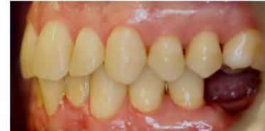
Supplementary Figure 2