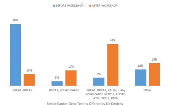
Figure 1 Comparison of what breast cancer gene testing was offered to non-syndromic breast cancer families in 24 UK Genetics Centres, before and after the UKCGG/UKGTN Inherited Cancer Panel workshop (n=24 responses).

In summary, it appears that there is a willingness to move towards the 2018 consensus, but the ongoing differences in gene testing offered between centres continues to raise concerns about the current equity of service for patients and their families across the UK. Additionally, the difference in the recommendations from the UKCGG/UKGTN meeting and the TD have resulted in further variation in practice, particularly for the moderate risk breast cancer predisposition genes ATM and CHEK2 . This is largely due to the UKCGG/UKGTN assessing only the appropriate inclusion of genes on a specific