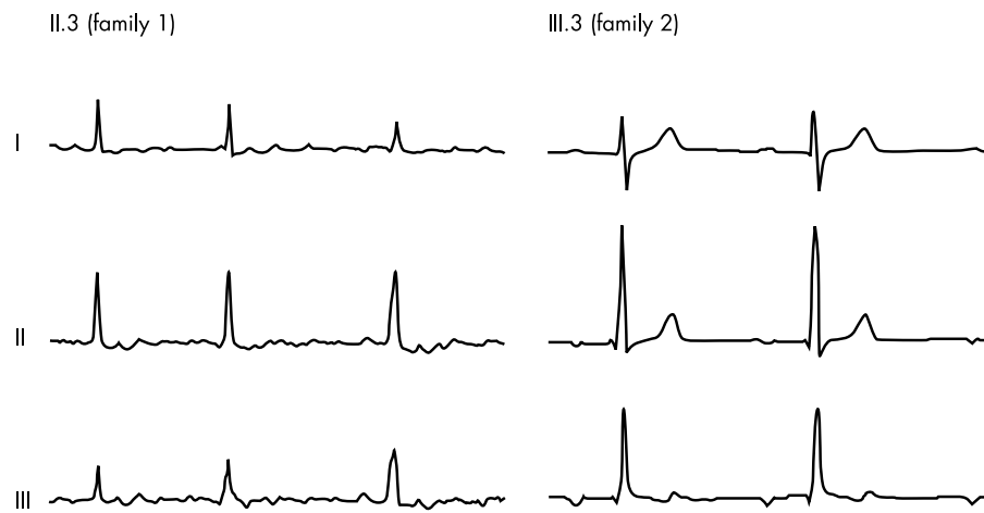
Figure 3 In II.3 in family 1, atrial fibrillation is the sole manifestation of cardiac disease. III.3 in family 2 had first degree AV block as the only manifestation of heart disease.

At least five out of 45 subjects with mutations in NKX2.5 lacked congenital cardiac structural anomalies and had only atrioventricular node dysfunction. Benson et al 1 reported a family BEF (C565G, Arg189Gly) in which three adult members who had never had congenital heart disease surgery were identified as having a variety of arrhythmias, including atrial fibrillation. In the same families observed with only conduction failures, patients with cardiac anatomical anomalies were found as well. Thus, it is difficult to outline any significant genotype-phenotype correlations.