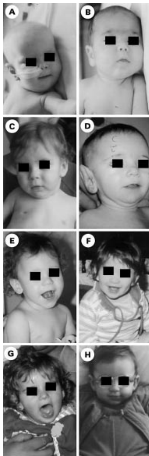
Figure 1 Facial features of eight patients with CDG Ia before 2 years of age. They all share common features including a high forehead, a very thin upper lip, and large and floppy ears. Note that patients 12 and 13 have upward slanting palpebral fissures while patients 2 and 15 have downward slanting palpebral fissures. (A) Patient 12. (B) Patient 13. (C) Patient 14. (D) Patient 15. (E) Patient 1. (F) Patient 4. (G) Patient 2. (H) Patient 3.

In the neurological-multivisceral form (patients 12-20), the patients were referred to a paediatric centre for failure to thrive with diarrhoea (4/9), pericarditis (2/9), liver disease (2/9), or proximal tubulopathy (1/9, table 1). Onset occurred before the age of 3 months, but the diagnosis was made later in life or even after death (16, 18, 19). The two sibs who displayed liver involvement (18, 19) developed hepatomegaly, vomiting, and liver damage during their first days of life and died of liver failure. Two sibs and an unrelated child had pericarditis at one week (16, 17) and 18 months respectively (12) and died before 2 years of age of their heart disease. The patients who survived (5/10) developed failure to thrive, hepatomegaly, and psychomotor retardation similar to the neurological form in the course of their disease. Patient 14 had severe enteropathy with diarrhoea, steatorrhoea, and recurrent episodes of fever related to low serum immunoglobulin levels requiring immunoglobulin infusions. Patient 20 had severe proximal tubulopathy but renal hyperechogenicity was present in all patients and histopathological analysis of the liver detected fibrosis in all patients tested (steatosis in 3/4 cases, cirrhosis in 1/4 case). By contrast, intestinal villous atrophy was found in only 2/6 patients tested