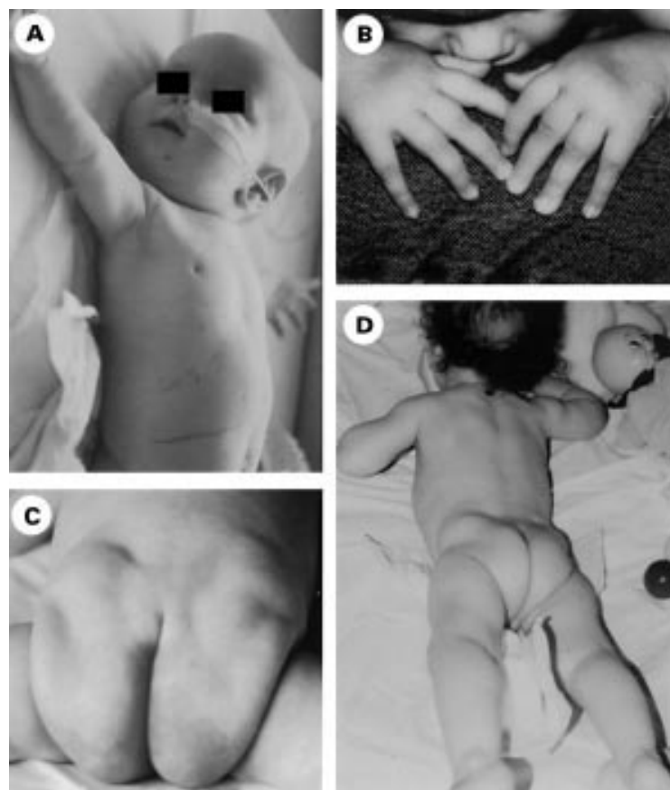
Figure 2 Classical features of CDG type I including inverted nipples (A) and abnormal fat distribution (C, D) with fat pads (B).