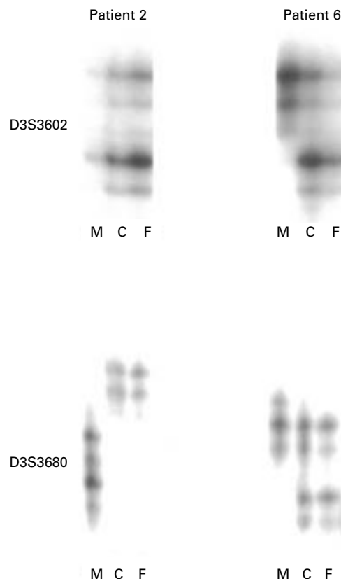
Figure 2 Polymorphic marker analysis of 3p- syndrome patients. Results for D3S3602 and D3S3680 are shown for P2 and P6. Both patients are heterozygous at D3S3602 and therefore not deleted for this marker. At D3S3680, P6 is also heterozygous, but P2 shows failure to inherit a maternal allele. M=mother, C=child (proband), and F=father.

The seven patients with the most centromeric deletion breakpoints were analysed in detail, including three of the cases reported previously (P2 (CUMG3.1), P3 (GM10922), and P5 (CUMG3.4)). Congenital heart disease was present in five of the seven patients. A total of 16 loci from D3S1585 to D3S1038 were analysed (tables 1 and 2, figs 1 and 2). The four patients with the most extensive deletions (P1, P2, P3, and P4), with deletion breakpoints between D3S3693 and D3S1263, all had CHD. A further three patients, one with CHD and two without (P5 (CUMG3.4), P6, and P7), had deletion breakpoints distal to D3S1263 and were informative for mapping the CHD gene. All three cases were deleted at