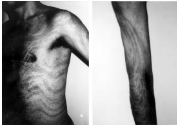
Figure 1 Photograph of the patient (reproduced with permission).

Fluorescence in situ hybridisation (FISH) was carried out on mitotic preparations according to Pinkel et al 11 with whole chromosome painting probes (CAMBIO) and alpha satellite