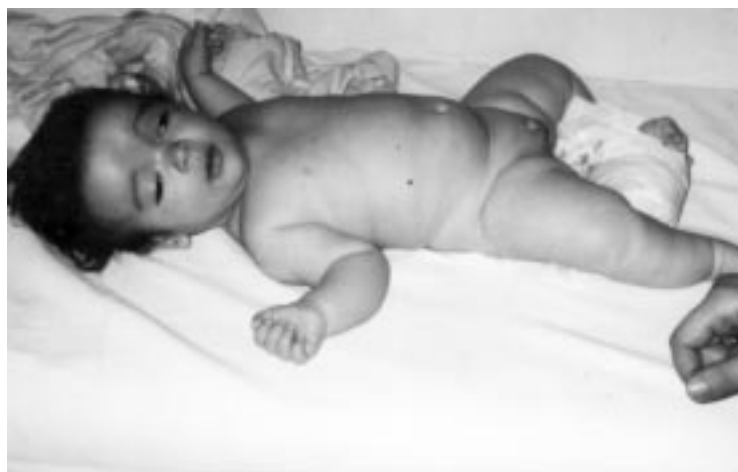
Figure 4 Appearance of case 2: note bilateral ptosis, depressed nasal bridge, broad nasal tip, micropenis, and bilateral undescended testes.

cerebellar peduncles were elongated and they appeared to course nearly perpendicular to the brain stem. The interpeduncular fossa was enlarged and deep at the pontomesencephalic junction and the CSF spaces appeared larger than normal around the mesencephalon.