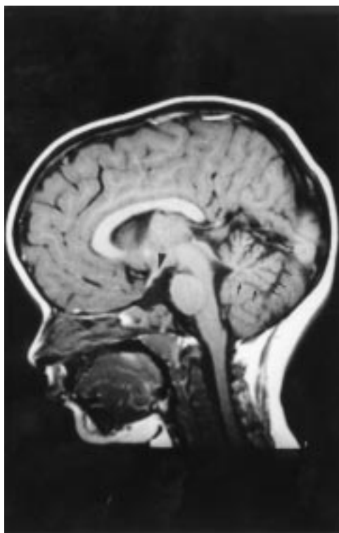
Figure 2 Case 1. Sagittal T1 weighted (400/14, TR/TE) MR image showing hypoplasia of the vermis (arrows); the posterior lobe is mainly affected. The sella is hypoplastic and empty. Ectopic posterior pituitary can be seen connected to the rudimentary infundibulum (arrowhead). The pituitary stalk is not visible.