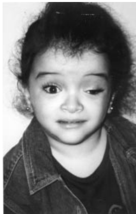
Figure 1 Facial appearance of case 1. Note ptosis of the left eye, epicanthus inversus, and depressed nasal bridge.

Case 1, a female, the first child of the couple, was the product of a pregnancy complicated by severe hyperemesis which required treatment, the nature of which is not known. Delivery was by LSCS at 42 weeks' gestation because of ineffective uterine contractions. The baby had transient cyanosis and required suction and oxygen. No neonatal measurements are available. The