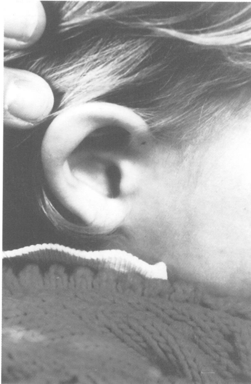
Figure 2 The ear of the present case. Note the thick and flat ear helix and the ear pit.

showed mild hearing loss, which improved after insertion of grommets. Vision was normal. Chest radiography showed first rib asymmetry, with the first rib on the left side situated anteriorly. Bone age showed a delay of 15 months.