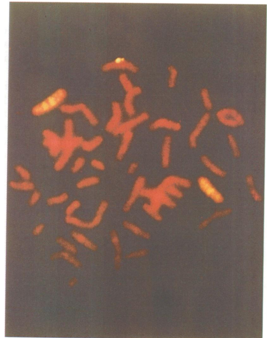
Figure 4 Results of fluorescence in situ hybridisation with a chromosome 10 paint.

Genes for the enzymes adenosine kinase and glutamate dehydrogenase are known to be localised to the proximal part of the long arm of chromosome 10. 9-14 Adenosine kinase activity was measured radiochemically essentially according to Leech and Newsholme, 15 following the conversion of adenosine to AMP using polyethyleneimine-cellulose thin layers. Glutamate dehydrogenase was measured spectrophotometrically as described previously. 16 Activities for the enzymes adenosine kinase ( 10.6 \pm 0.1 nm/10 6 lymphocytes/h; normal 7.9 \pm 3.6 nm/10 6 lymphocytes/h) measured in lymphocytes and glutamate dehydrogenase