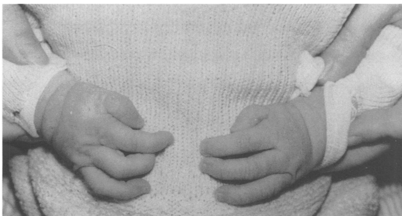
Figure 2 Hands of the proband showing absence of the fifth fingers.