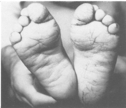
Figure 3 Plantar keratoderma in case 2 at 2 years.

disorder. 2-4 Since the parents of our patients are normal and consanguineous, autosomal recessive inheritance is suggested. Therefore, several disorders were considered in the differential diagnosis, including the Mal de Meleda syndrome, 6 Richner-Hanhart syndrome, 7 and Papillon-Lefevre syndrome 8 (table 2). Since both our patients are males, X linked inheritance cannot be ruled out.