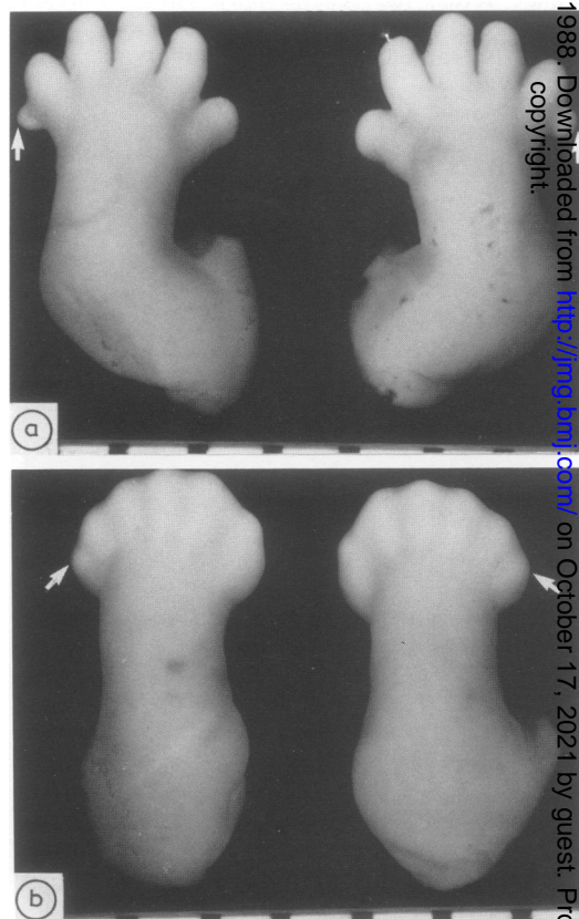
FIG 2 Upper (a) and lower (b) limbs showing supernumerary digits on the postaxial side (arrows).