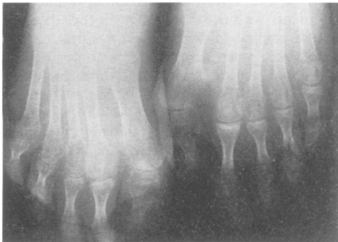
FIG 2 Monophalangic big toes in FOP