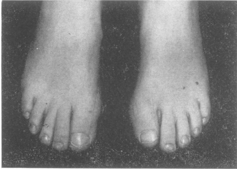
FIG 1 Shortened big toes in FOP

No proband had an affected relative although five first degree relatives (four females and one male) had unrelated primary hallux valgus. Thus, all probands in this series represented fresh FOP mutations. None