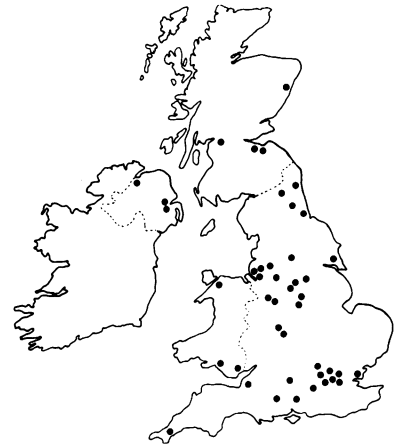
FIG 4 Geographical distribution of new FOP mutations according to place of birth

of these patients had reproduced. Fig 4 shows the geographical distribution of these new FOP mutations according to place of birth. Clustering of these new mutations was evident but conformed to the 1951 population distribution as a whole. 5