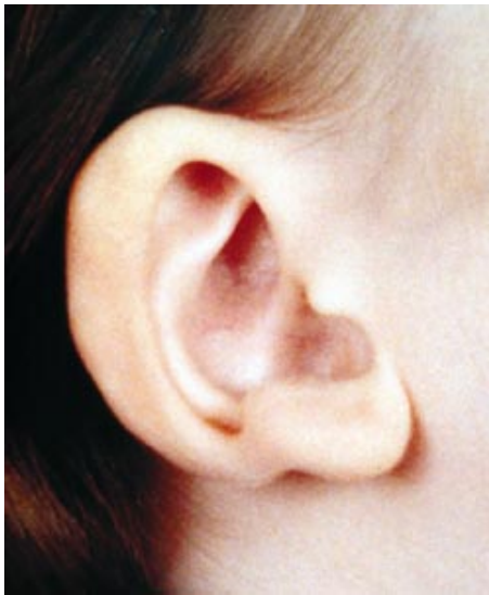
Figure 2 Characteristic appearance of the posteriorly rotated ears with an uplifted ear lobe and central depression ("corpuscular-like").