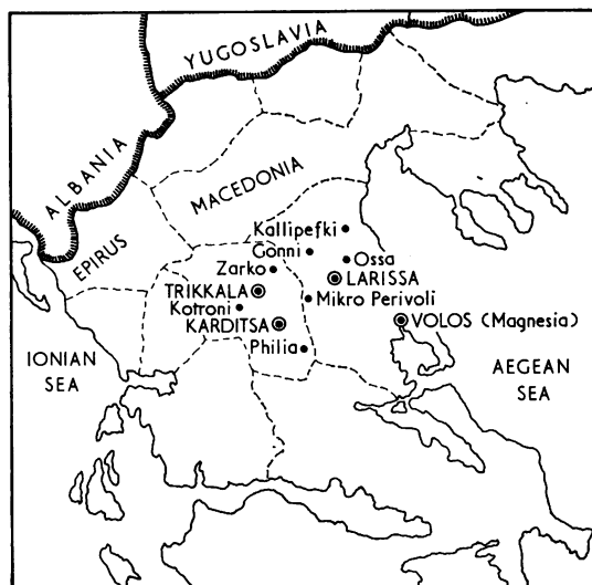
FIG. 1. Map of the region studied in Thessalia, Central Greece. This shows the four main cities and the seven villages studied.

direct estimate of the iodine content of the diet, but the urinary excretion of iodine* seems to be extremely low, being below 10.0 \mu\text{g.} a day in 9 out of 13 goitrous patients. This is evidence for the presence of a frank iodine deficiency in the majority of the population concerned.